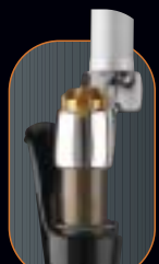
EXTENSION CONTROL "ON"